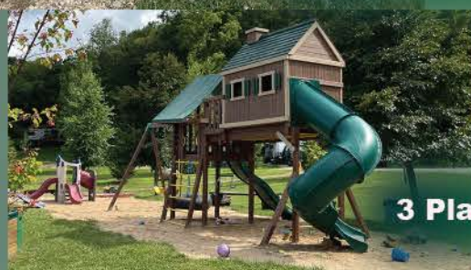
3 Playsets and sandbox