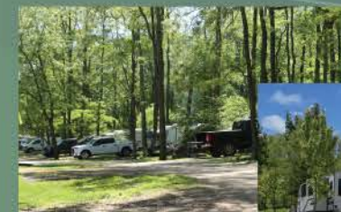
RV Sites Pullthroughs, backins, sun and shade.