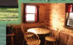
Amish Cabin A real Amish hunting cabin. Sleeps 2-3.