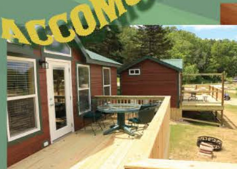
Full Service Cabins Kitchette, bath, shower, sleeps 6.