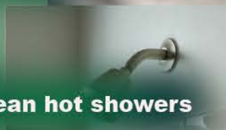
FREE clean hot showers