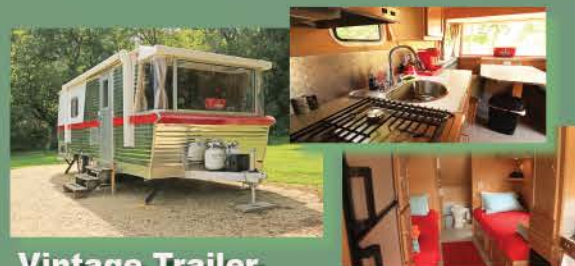
Vintage Trailer Modern RV, kitchen, bathroom with shower, air conditioning. Built to 1966 design. Sleeps 4.