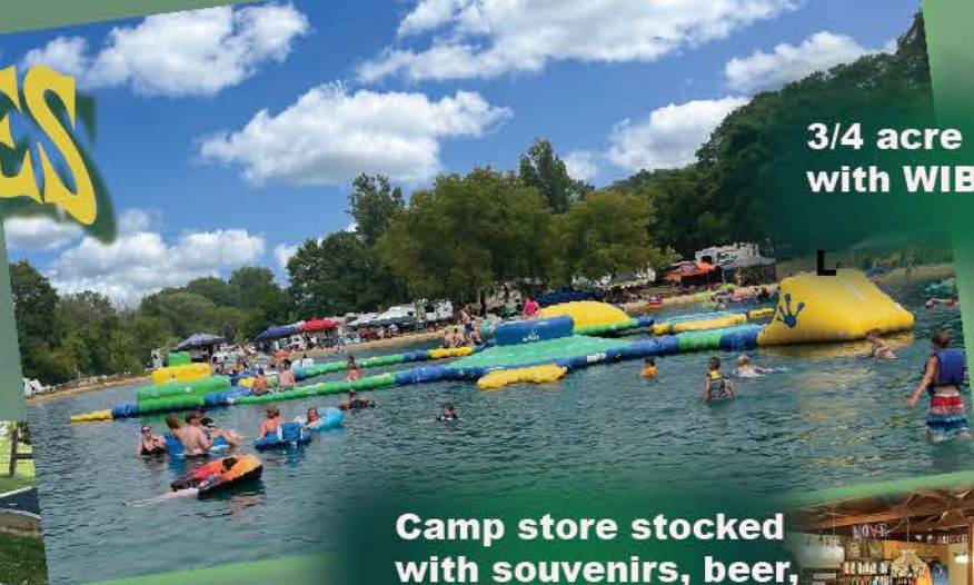
3/4 acre swim pond with WIBIT inflatables