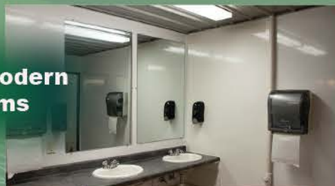
Clean modern bathrooms