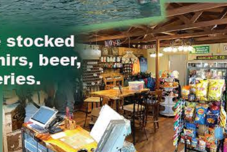
Camp store stocked with souvenirs, beer, wine, groceries.