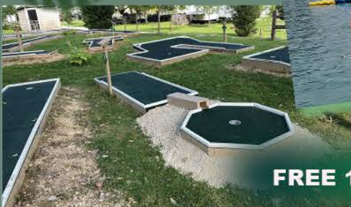
FREE 18-hole minigolf.