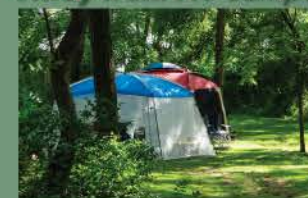
Quiet Tent Sites Away from RV campers.